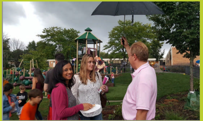
Festivities during annual Back to School Bash.