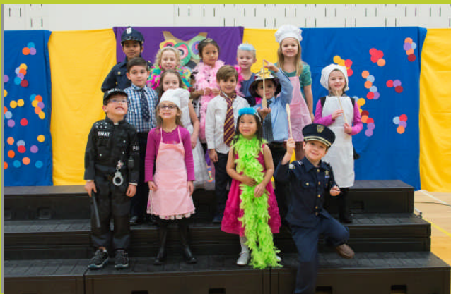
Class performance during PTO's annual Book Fair.