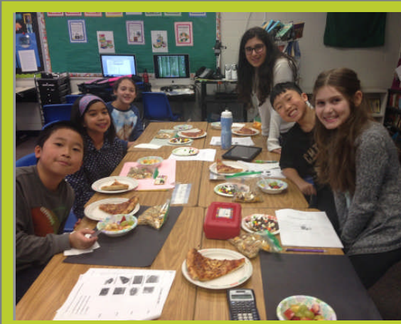
With the help of parent volunteers, 5th graders experience math concepts such as fractions during Fraction Café.