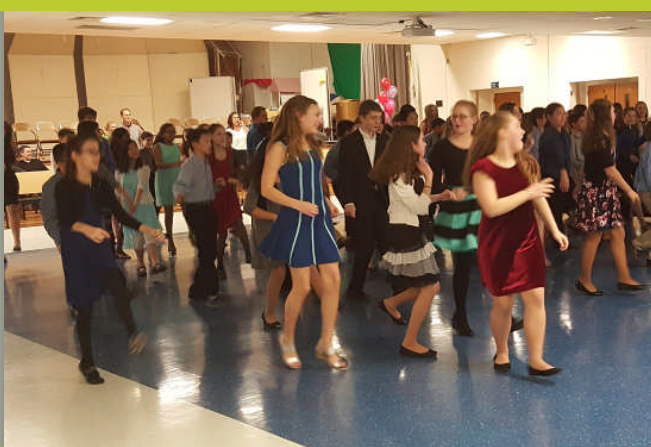
Social Dance Lessons allow 6th graders to learn basics of Fox Trot, Cha Cha, Electric Slide and more.

Every year, PTO helps organize or sponsor a wide range of programs geared toward the current curriculum and enriching the students school experiences: