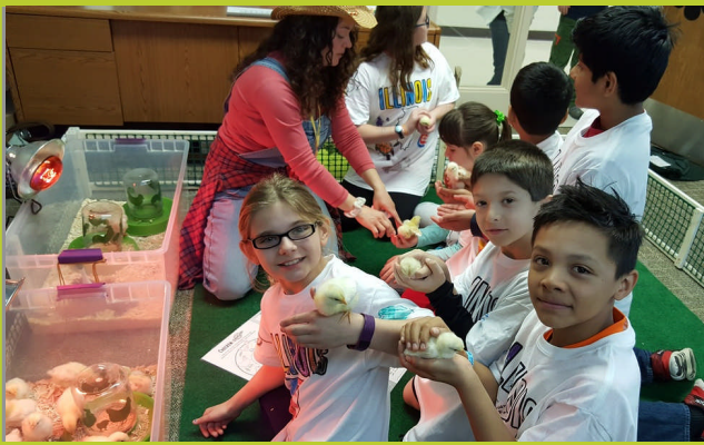
4th graders learn all about the State of Illinois during PTO's annual State Fair in May.