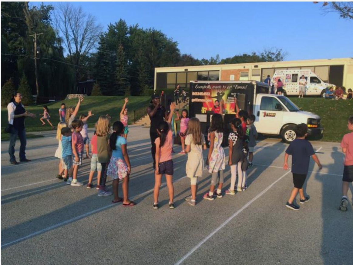
Back to School Bash at Sprague, 2017.